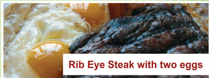
Rib Eye Steak with two eggs